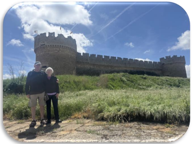
One of many castles to enjoy!