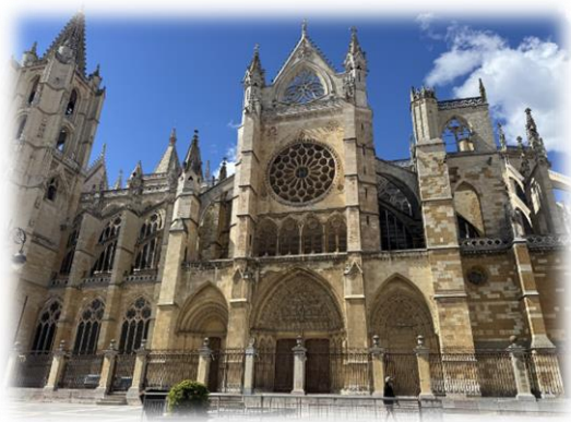
Cathedral de Santa Maria, Leon. A magnificent structure featuring a considerable amount of stunning stained glass.