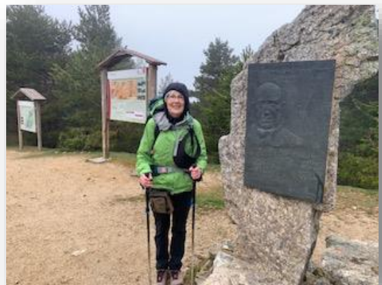
Arrival at top of Sierra de Quadorrama. A difficult steep climb up rocky mountain terrain on a cold day!