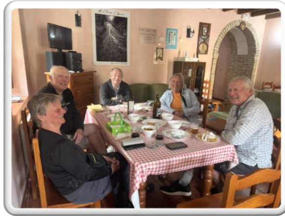
Enjoying a communal meal of Bread Soup with fellow pilgrims.