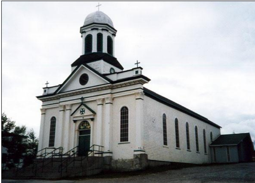
St. Joseph's Church, St. George's, NL