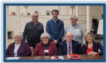
Mercy Wellsprings Board of Directors

Deep Listening - hear the voices of people, of Earth beings, and of Earth herself