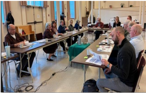
Formation Session March 2025