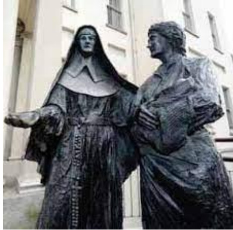
Statue of Catherine welcoming a young mother and baby to Baggot Street