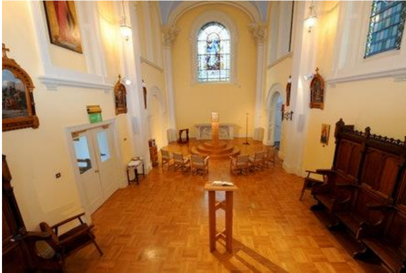
The Chapel at Catherine's House in Baggot Street

Catherine viewed receiving Jesus in the sacred mystery of the Eucharist as the highest act of worship. The celebration of the Eucharist, a communal celebration, is the source and summit of the life of a Christian.